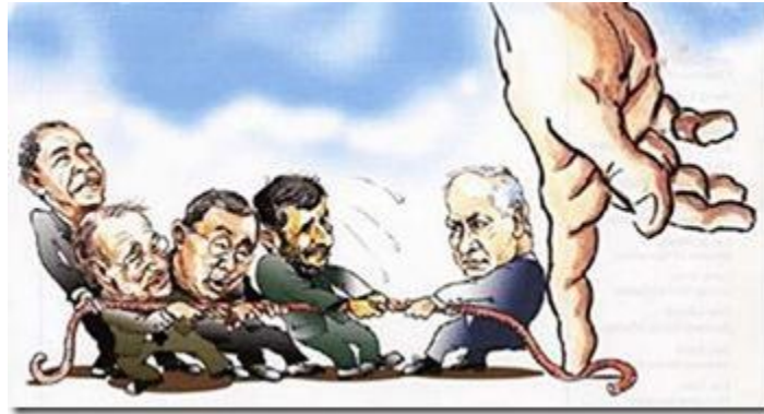
God is in Control