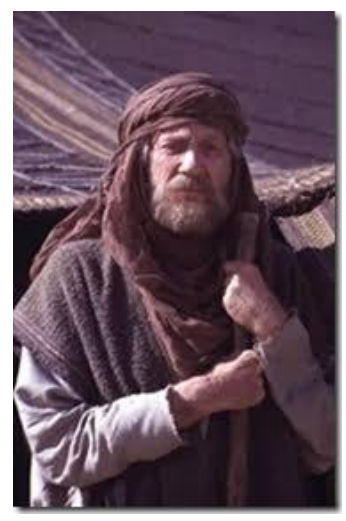
Jethro, Priest of Midian

asah Elohim l'Moshe ul'Yisra'el amo ki-hotsi Adonai et-Yisra'el mi-Mitsrayim. done for Moses and for Israel; how the Lord had brought Israel out of Egypt.