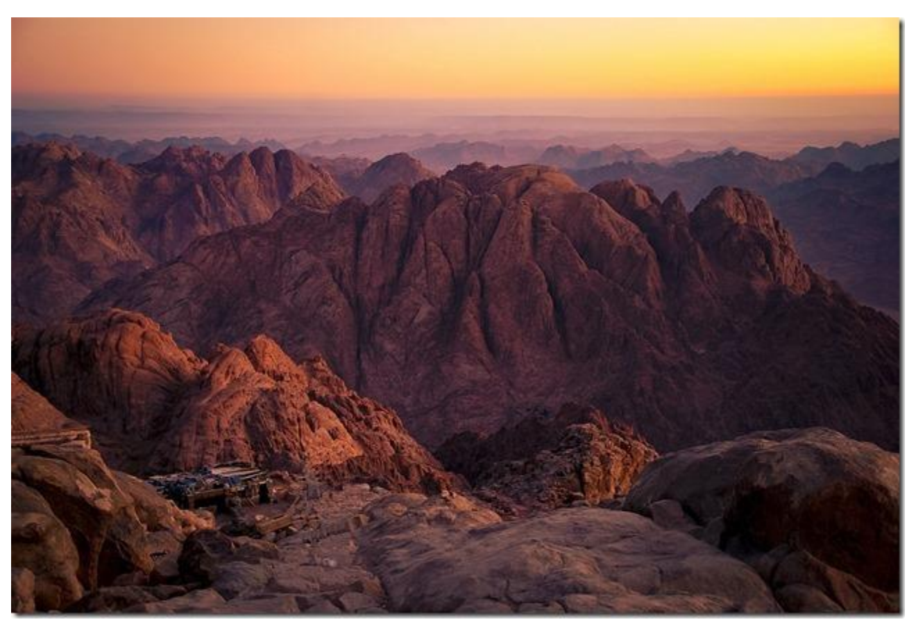
Mount Sinai Today with St. Catherine's Monastery

Three months after leaving Egypt, Moses led the people from Rephidim into the wilderness of Sinai. They camped on a large, flat plain in front of Mt. Sinai, fulfilling God's promise to Moses in Ex.3:1,12 , to bring him and the people to this very mountain.