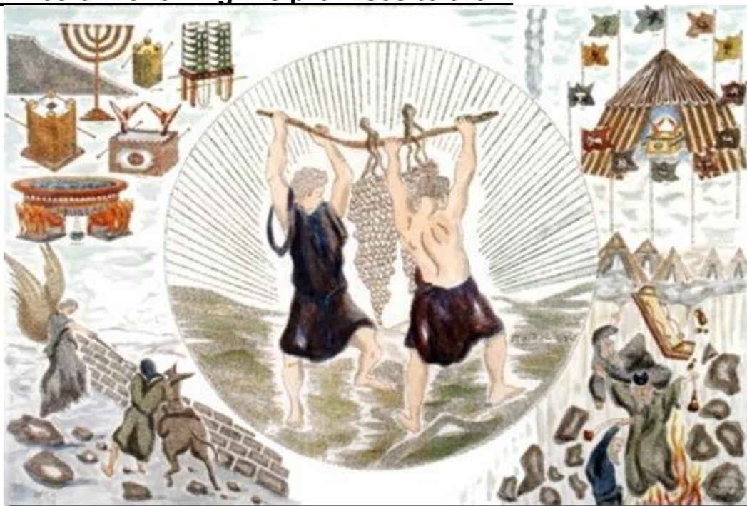
Whole Book of Numbers

Him! Blessings to God's people occur when they keep their vows to God and focus their lives on following His promises to them!